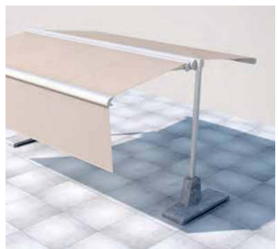
Individually Extending Round & Square Design