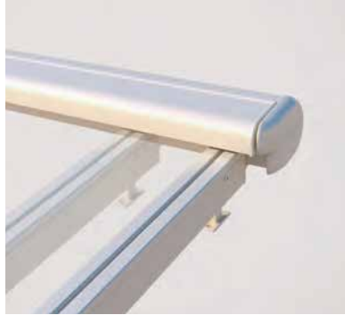
Adjustable guide rails