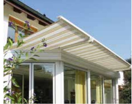
Showing retractable extrusion